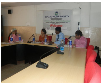
School Board Meeting in Progress