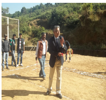
Hon'ble VC at the Inauguration of Sports Facilities