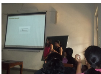
MBA Students at LSR