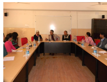
Vice Chancellor Addressing the New Faculty