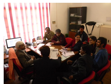
CUHP Chronicle Editorial Team in Action