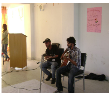
Students performing during Sur-Sangam